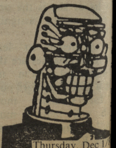
Thursday, Dec 1/