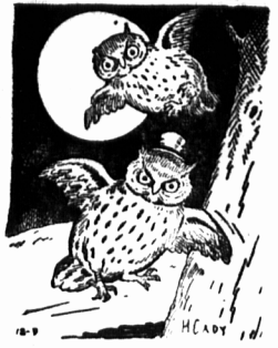
Hooty and Mrs. Hooty were very much awake.

After that, every little sound he heard he was sure was made by one of those two feathered hunters looking for him. It was the most awful night he had ever spent. When it was over and jolly, round, bright Mr. Sun began his morning climb up in the blue, blue sky, the young Grouse saw Hooty and