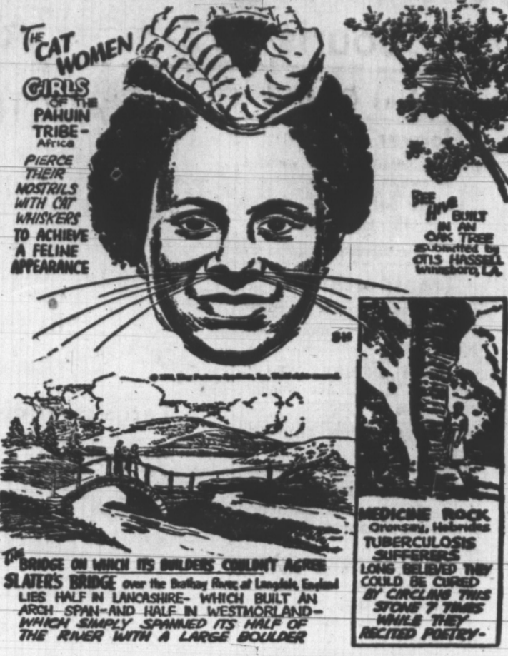
BRIDGE ON WHICH ITS BUILDERS COULDN'T AGREE

SLICES BRIDGE over the Highway 300 at Lunenburg, Island of PEI, was built by ARCH-Span and Half in Westmorland, which simply spanned its half of the river with a large boulder.