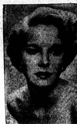
RING FROM BING?

Seen often with Bing Crosby these days is screen actress Mona Freeman and Hollywood rumorists are whispering "Romance!"