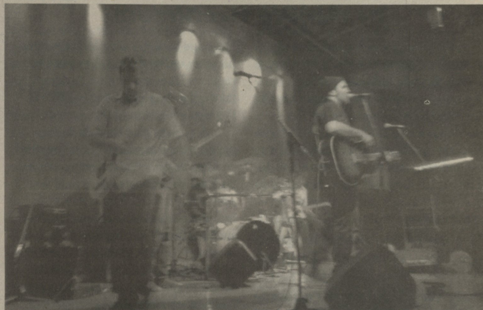
The Rude Mechanicals rocked UPEI into the new millennium... make that 2003.