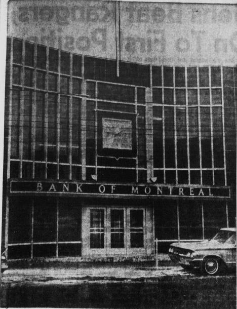
NEW BANK SITUATED ON GRAFTON STREET IN CENTER OF CITY