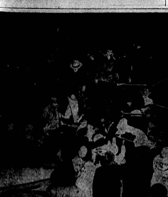
Rescue workers are shown (center) removing the body of one of the persons killed when the Pennsylvania Railroad commuter train...

During the week, hockey took precedence over basketball for the first time this year in extramural competition. The only basketball activity was a juvenile game between the Saints and Y.M.C.A. which the Saints won 33-17.