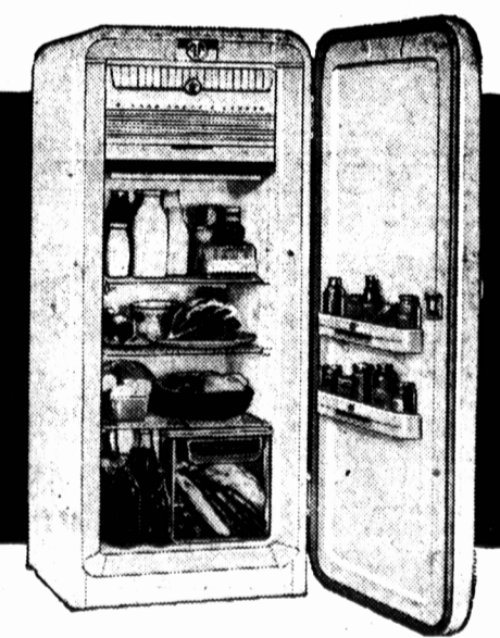
MODEL FM-734. 7 cu. ft. Wonderful value in a medium size refrigerator that's ideal for the small family. Fits perfectly into apartment or small kitchen. Has a full-width Freez'r Locker, Swing'r Crisp'r, Door Racks, Cameo Cream styling. All for only $279.75