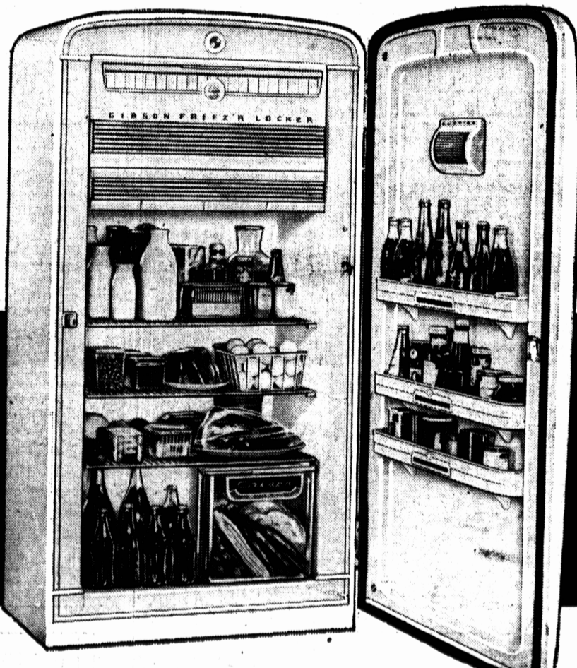
MODEL FM-944. 9 cu. ft. A big family-size refrigerator at a very reasonable cost. Lots of room plus Cameo Cream styling, full-width Freez'r Locker, Swing'r Crisp'r, Butt'ry and Door Racks. All for only $349.75

See a demonstration of a Fairbanks-Morse Gibson refrigerator at any of the dealers listed below and you will receive a FREE Cutex Manicure Set. That's all you have to do to receive your free manicure set consisting of polish remover, base coat, polish and manicure accessories. This offer is limited—so come in soon.