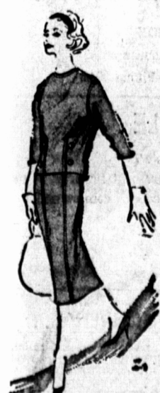
By VERA WINSTON SEAMED SUIT

SWEDISH LAKE Lake Venner, largest lake in Sweden, is about 87 miles long and 45 miles broad.