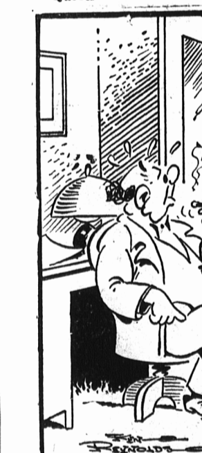
"I'm beginning to think Alvin has found a better job in the Guardian Want Ads!"