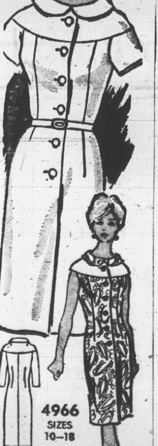
4966 SIZES 10-18 by Anne Adams Snappy Look

Refreshments were served by the hostesses.