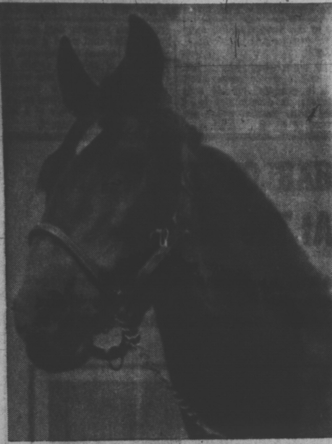
STARBURN Stallion Starburn a picture of power