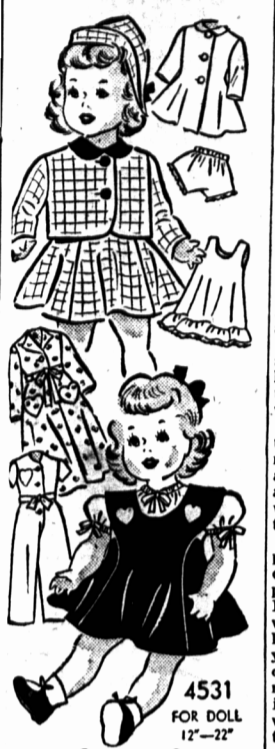
4531 FOR DOLL 12"-22" by Anne Adams

A Christmas gift your little girl will enjoy all year! Her beloved doll will look brand new in these adorable togs. Smartest fashions—easy sewing. A few gay scraps will make the entire wardrobe—hat, jumper, jacket, blouse, coat, robe, pajamas and lingerie! Pattern 4531 is for dolls 12, 14, 16, 18, 20, 22 inches tall. Yardage requirements in pattern. This pattern easy to use, simple to sew, is tested for fit. It has complete illustrated instructions. Send THIRTY-FIVE CENTS (35 cents in coins (stamps cannot be accepted) for this pattern. Print plainly SIZE, NAME, ADDRESS, STYLE NUMBER. Send order to ANNE ADAMS, care of Charlottetown Guardian, Pattern Dept., 60 Front St., West, Toronto, Ont.