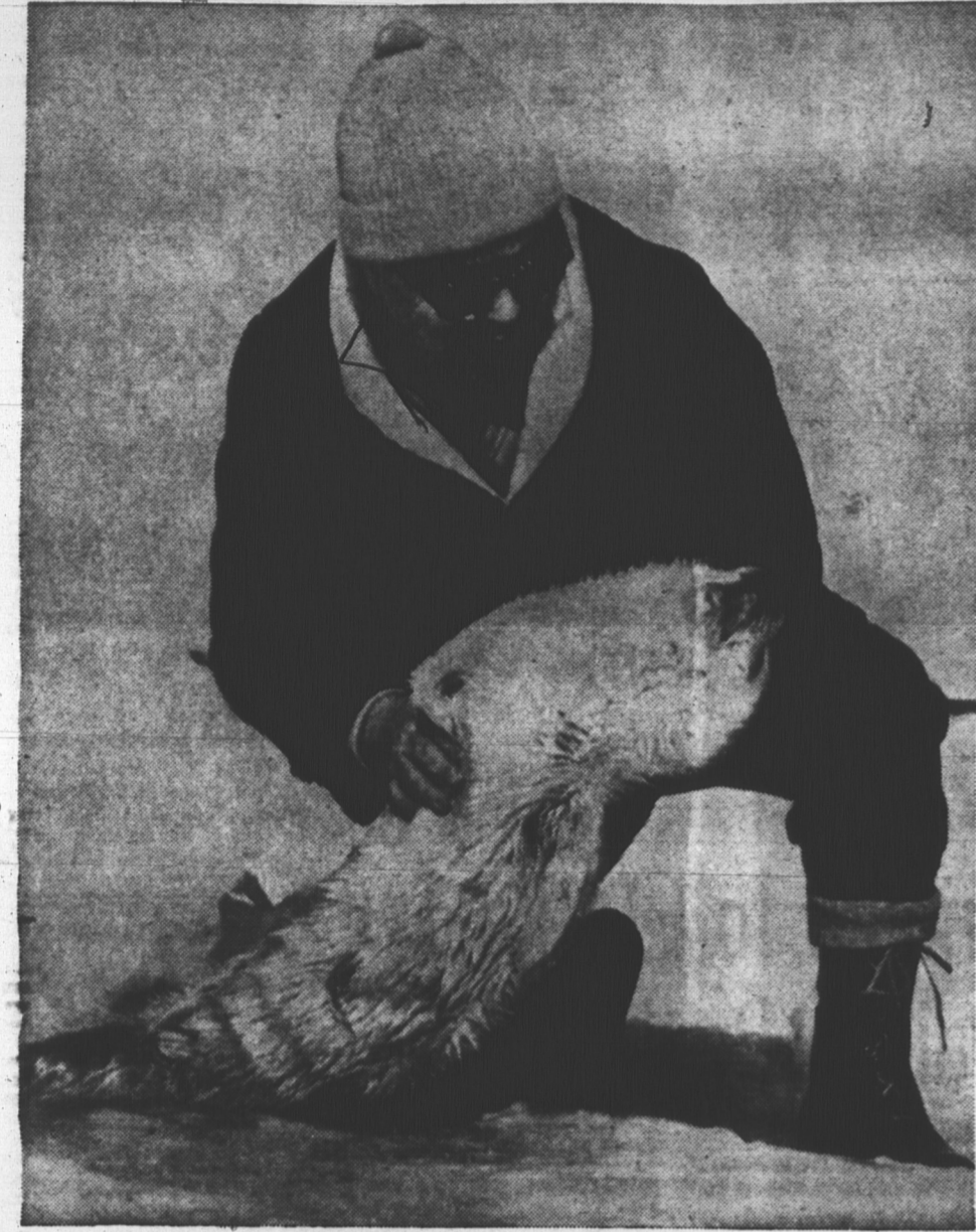
HEAR A SEAL LAUGH

Authorized as Second Class Mail by the Post Office Department, Ottawa and for Payment of Postage in Cash.