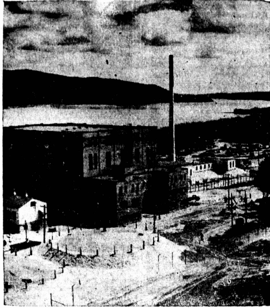
CANADIAN ATOMIC RESEARCH PROJECT, CHALK RIVER, ONT.