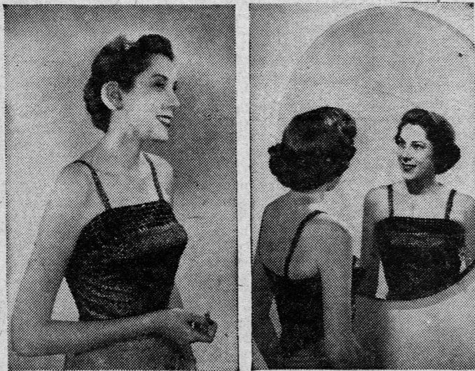
WORN ENTIRELY AT THE EAR is Zenith's new Diplomat hearing aid. Left, the tiny Diplomat in place. Right, the instrument concealed by the wearer's hair. Though it weighs less than an ounce including battery, the Diplomat is a practical, full powered 4-transistor hearing aid.