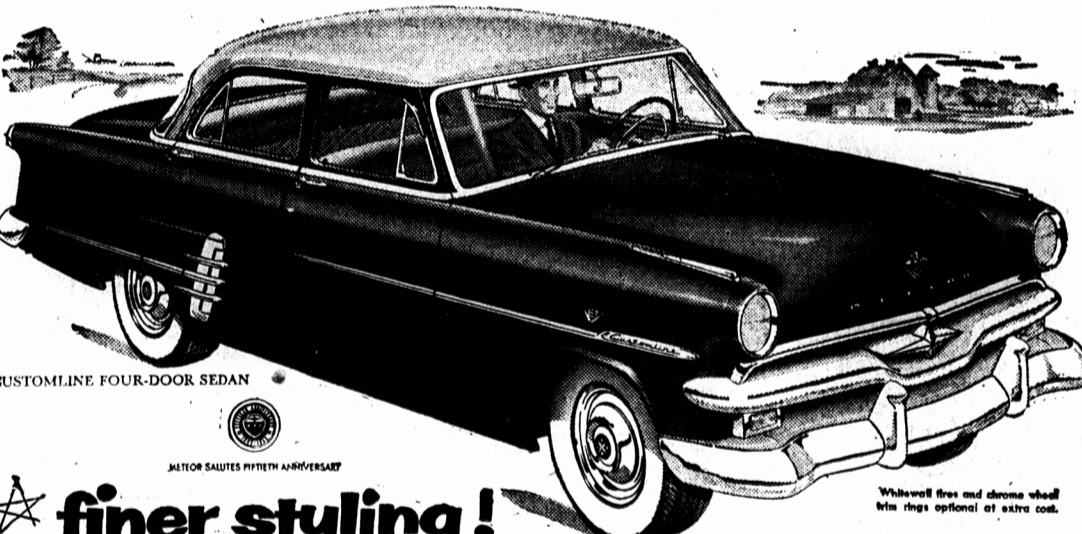
CUSTOMLINE FOUR-DOOR SEDAN