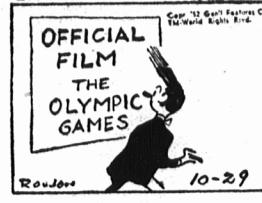
OFFICIAL FILM THE OLYMPIC GAMES