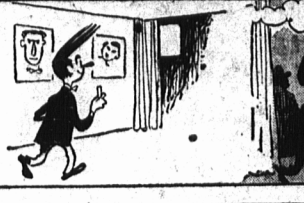
SEATS FOR THE OLYMPIC GAMES