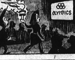
SEATS FOR THE OLYMPIC GAMES