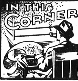
IN THE CORNER