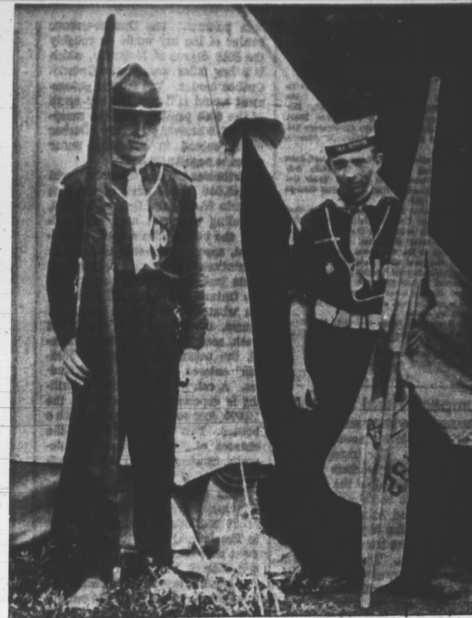
SCOUTS AND SEA SCOUTS UNDER CANVAS