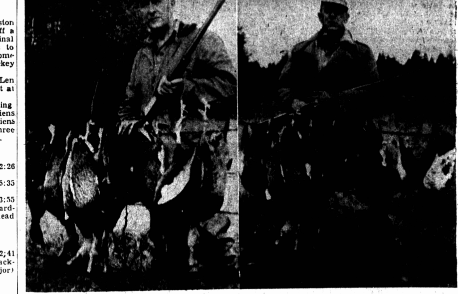
Bruce and Lloyd Wannacott, Charlottetown, made good on an early start Saturday morning, completing the bag limit in time for a late breakfast. Lloyd (left) eight black ducks and one pheasant "cock". Bruce, five black ducks, three teal ducks and one pheasant "cock".