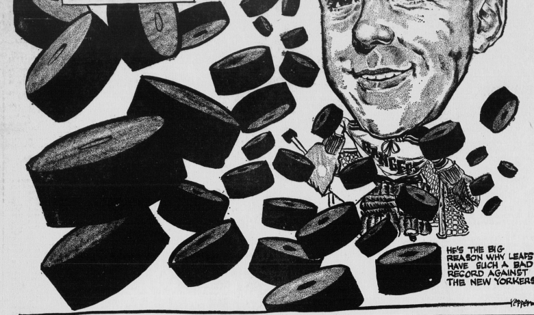
HE'S THE BIG REASON WHY LEAFS HAVE SUCH A BAD RECORD AGAINST THE NEW YORKERS

IF THEY AWARDED THE VEZINA ON A SHOTS-ON-GOAL BASIS, RANGERS' GUMP WORSLEY WOULD SURELY BE THE LEADING CANDIDATE THE LITTLE GUY WITH THE BIG SENSE OF HUMOR HAS BEEN BUSIER AND BETTER THAN EVER!