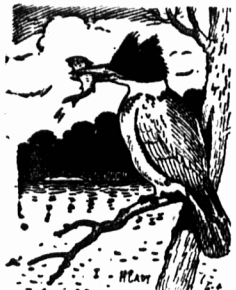
He got the breakfast he much needed.

Success is here and there at hand. Success is sweeter in the end. —Old Mother Nature. Rattles had a falling out. It was partly because Rattles was feeling out of sorts. He had had bad luck fishing, and so had had no breakfast. So it was that he disagreed with Mrs. Rattles as to where they should make their home. The fact is, he would have disagreed with anybody on any subject that morning. Folks get that way sometimes especially when they are hungry.