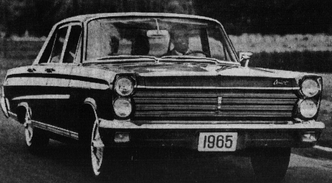
Comet Caliente 4-door sedan