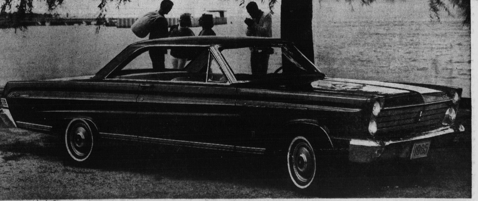
Comet Caliente 5-door hardtop

Now, here's the '65 Comet, young, spirited, handsome as all get out and luxurious to boot.