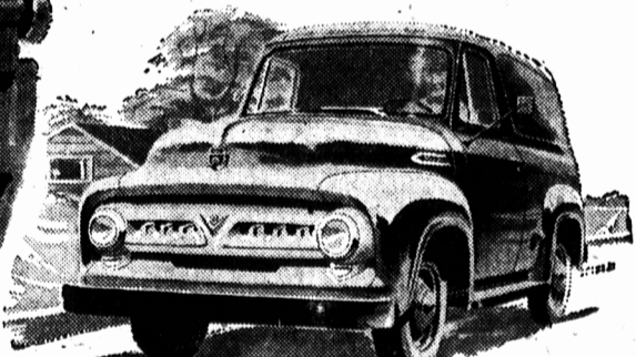
F-100 8-ft. Panel G.V.W. 4,800 lbs.

Ford Trucks cost you less on the road. Dependable V-8 power pulls more on tougher routes for every gallon of gas. Ford Driverized design—with shorter wheelbases and wider front treads—gives time-saving, money-saving manoeuvrability.