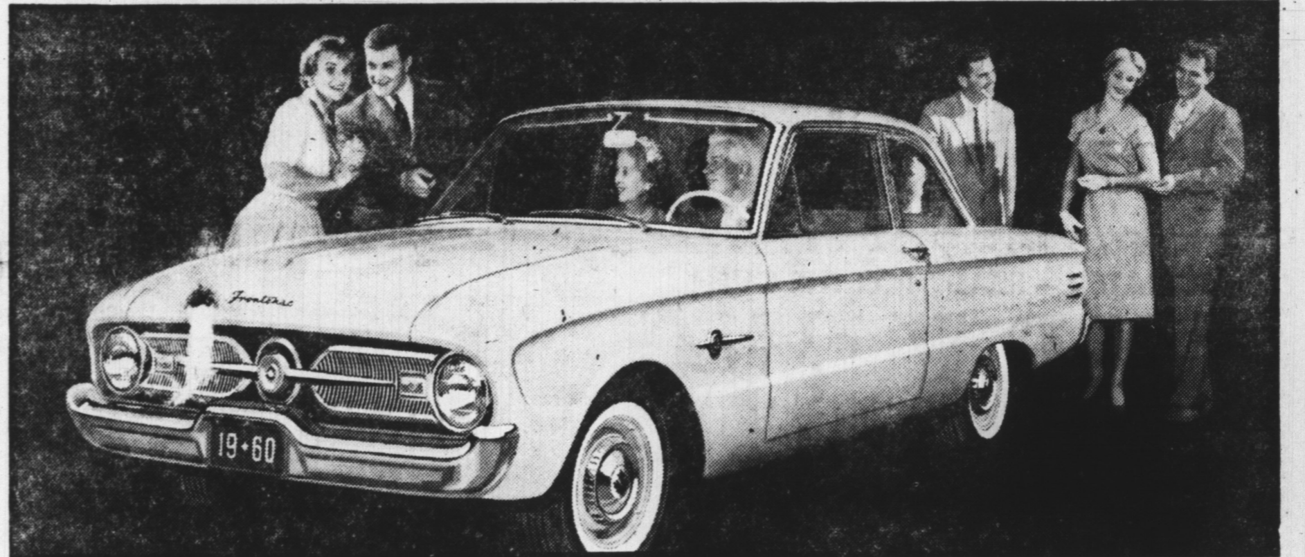
The eventful FRONTENAC two-door sedan—one of Ford of Canada's fine cars.