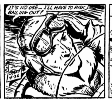
By Ham Fisher