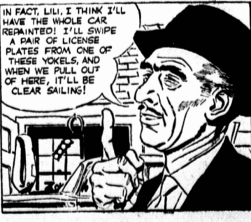
By Walt Kelly