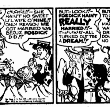
By Alex Raymond