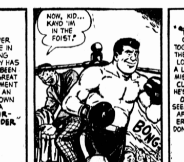
By Al Capp