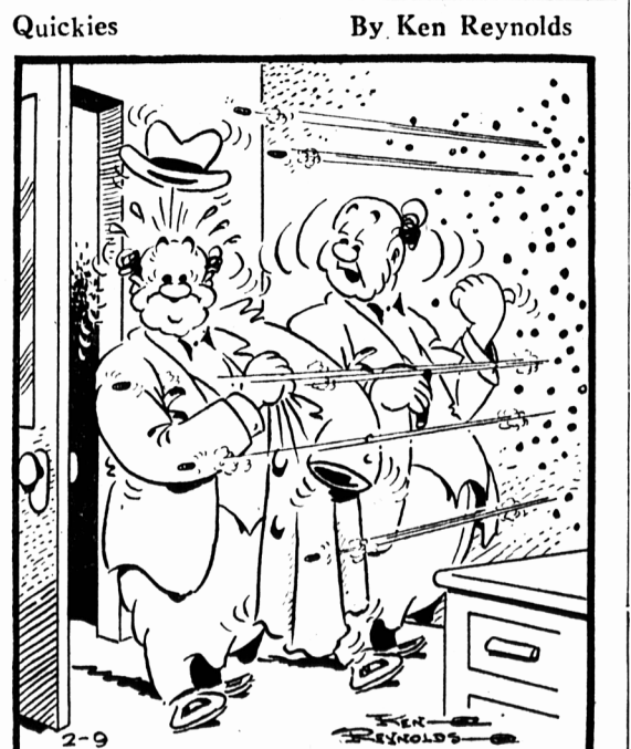
"Knotty pine? - - - no, I rented the room next door with a Guardian Want Ad to a shooting gallery!"