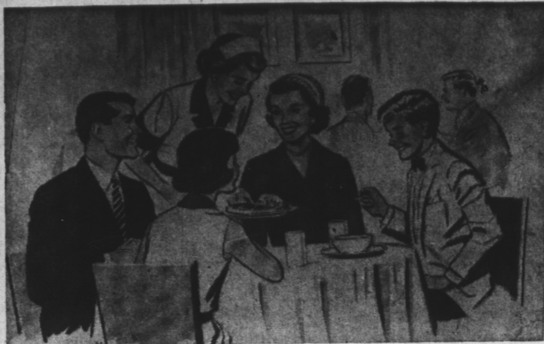
OCTOBER IS RESTAURANT MONTH