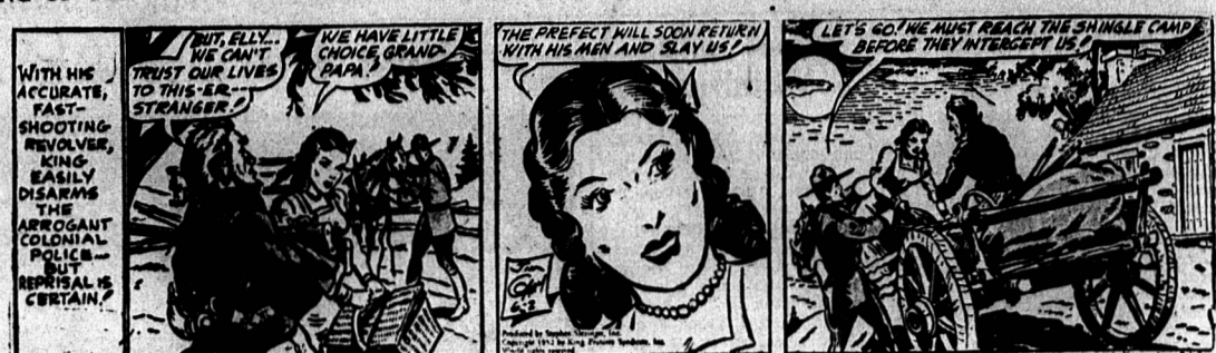
By Ham Fish