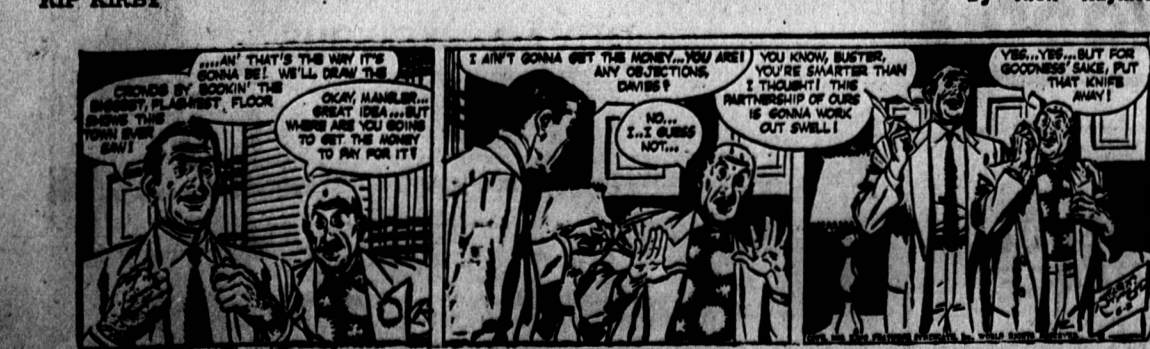
By Alex Raymond