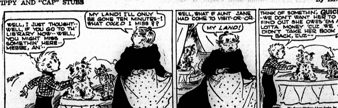
By George McManus