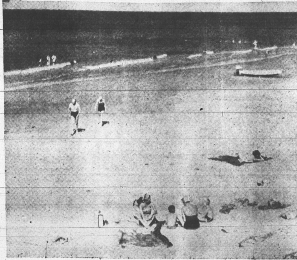
Enjoy the many miles of beaches surrounding beautiful Prince Edward Island.