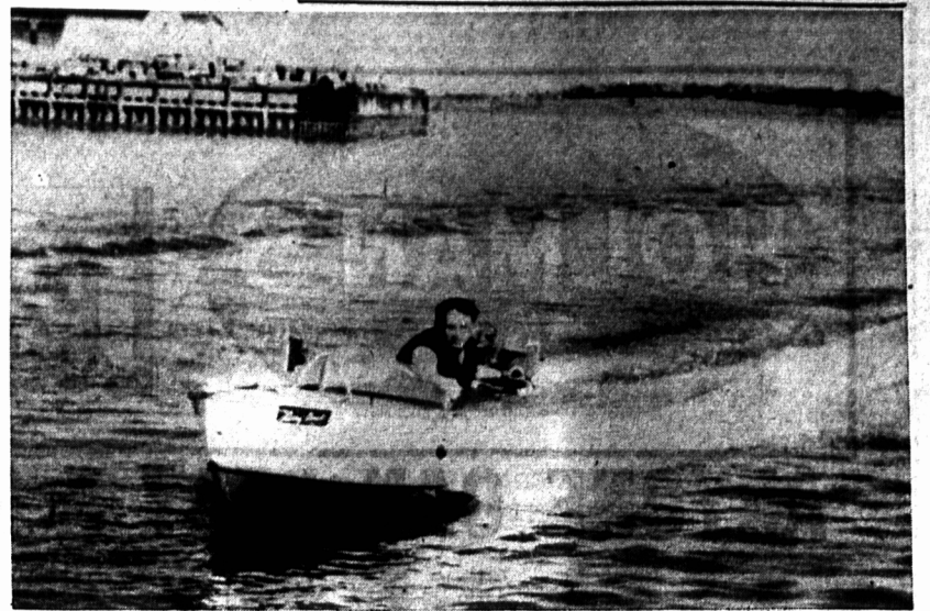
A white wake swirls behind the MacNeill of Summerside as it approaches the finish line in the 25 H.P. class in the boat races at the Lobster Carnival on Saturday afternoon.

A Walter Callow coach will be in Alberton on Thursday. It has been announced by Regalette Rebekah Lodge under whose auspices two previous visits of a coach have been made to this area. Plans for the visit of the coach will be finalized this (Monday) evening. The morning trip will be made through Kildare and Alma and the afternoon one via Elmsdale and Cascompec. On previous occasions a large number of elderly and shut-in folk have enjoyed an outing and will be looking forward to this year's ride with eager anticipation. If there are any persons confined to their homes who have not been contacted, any member of the lodge will be glad to receive their names at once in order that they may be included in one trip of the coach on Thursday.