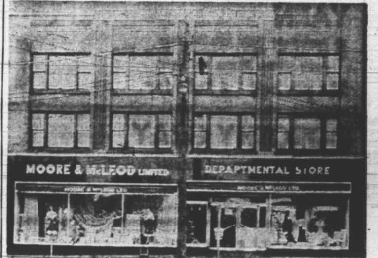
Moore & McLeod Limited . . . one of Prince Edward Island's departmental stores!

P. E. I. is noted for its traditional hospitality. These Island merchants welcome you to our Province . . . and trust that you enjoy our hospitality to the full.