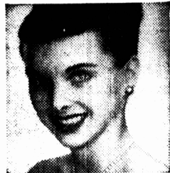
For Complete Skin Care

Cuticura offers a proved way to a softer, smoother, clearer complexion. For it is especially made to help the skin to protect—preserve—help keep it fresh and younger looking!