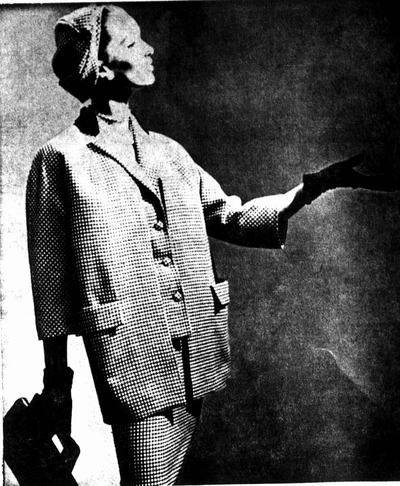
SMARTLY TAILORED ENSEMBLE

By Basta of Paris, is this ensemble in black-and-white check-wool flannel. The collarless straight jacket with kimono sleeves, tops a fitted suit with tailored lapels and black velvet collar. The beret is in the same black-and-white checked wool flannel.