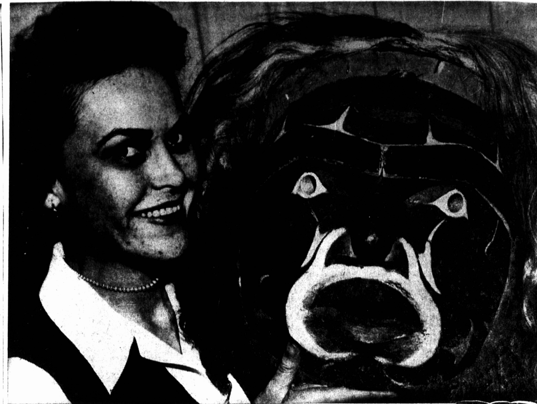
THIS STONE FACE WON'T SMILE

Did you ever wonder why you have to pay so much for the best quality goods? The answer is simple. The goods you buy from the grocery store as you do for the one that's delivered to your door in the morning? The Canadian Association of Consumers believe this is unfair and they have succeeded in obtaining a lower store price in both Manitoba and British Columbia. This work is continuing in the other provinces and the CAC is also fighting for consumer representation on Milk Boards across Canada. Joining the Canadian Association of Consumers will help to assure a consumer voice being heard in governing prices and standards of milk.