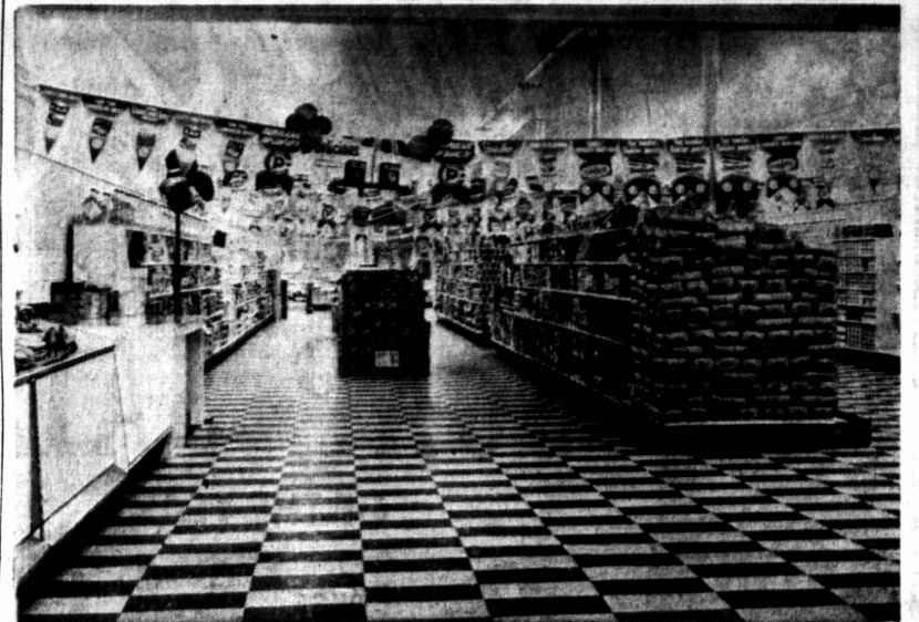
REBUILT SECTION OF STORE