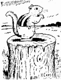
He had climbed up on a stump.

Little Stripes, the very small Chipmunk starting out in the Great World to make a place for himself, was wishing very hard that he could find his way back home. Just now it seemed to him that the home where he had been born was the safest and most wonderful place in all the Great World. He wished that he hadn't left home. Now he hadn't the least idea where that home was. It was under the old stone wall on the edge of the Old Orchard, and this was really only a little way from where he was in the Green Forest. But it might just as well have been on the other side of the Great World as far as he was concerned.