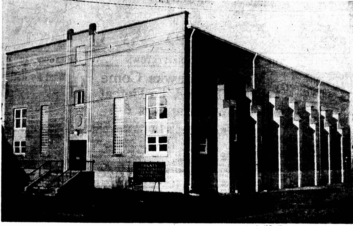
Pictured above is the recently completed Holy Redeemer Community Centre which is expected to be formally opened sometime within the next month. Of brick and concrete construction, the modern structure houses facilities for sports, culture and welfare activities and will fill a long felt need in the parish. The main auditorium is fully equipped for dramatics and has a seating capacity of seven hundred and fifty, with a balcony running across the back of the hall. Gymnasium facilities are also included, along with bowling alleys, community rooms and offices of the Credit Union.