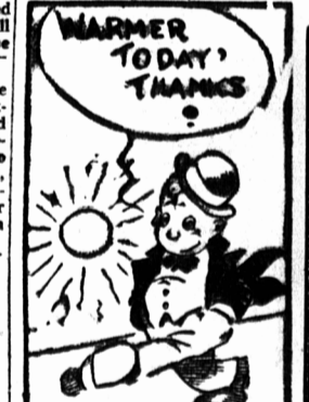
WARMER TODAY THANKS?