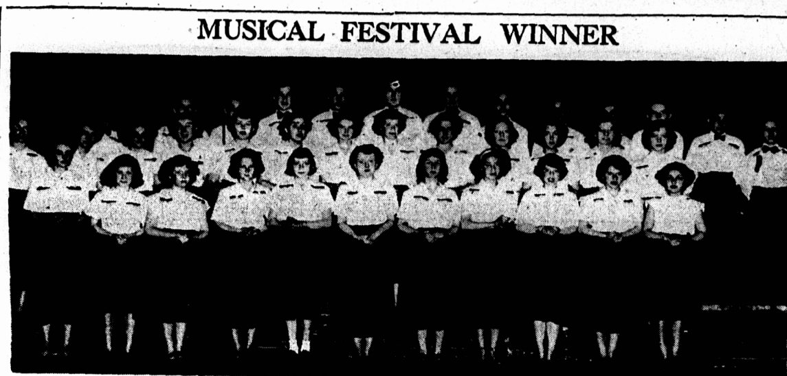
Pictured above are pupils of grades 8 to 10 who comprised the Parkdale School Chorus which was the winner in Class 64 of the recent Festival of Music. Of the five entries in this class, Parkdale received the high mark of 80 points.