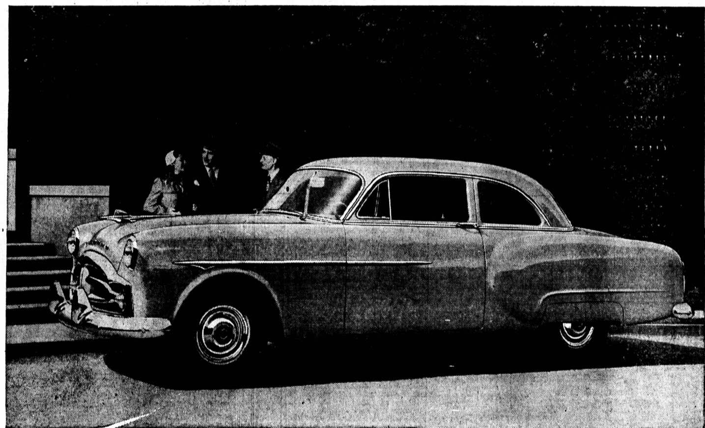
Above: New 1951 Packard '200' Club Sedan $3613—delivered in Windsor. Car details as shown subject to change without notice.

Soothe them with MINARD'S LINIMENT 35¢ LARGE ECONOMICAL SIZE 55¢