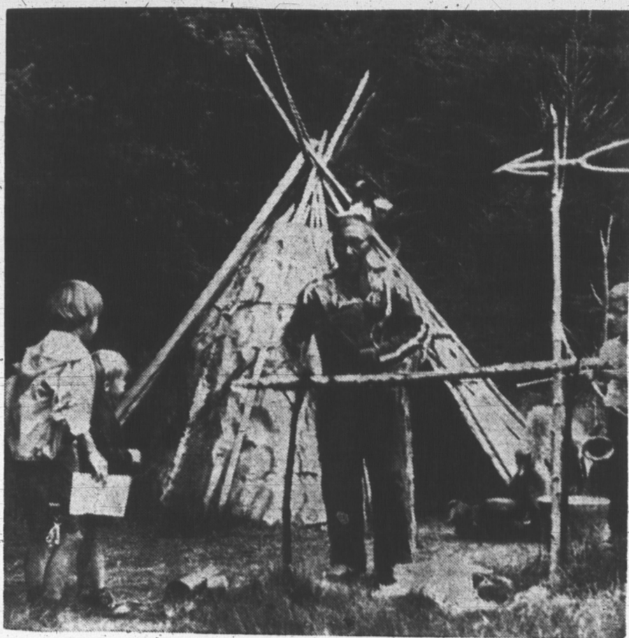
Mic Mac Indian Village located at Rocky Point, P.E.I.

Visitors Welcome ● Yarns ● Blankets ● Auto Robes ● Island Tartan Blankets Made of 100% Virgin Wool WM. CONDON and SONS 65 Queen St. Dial 4-8712 Charlottetown