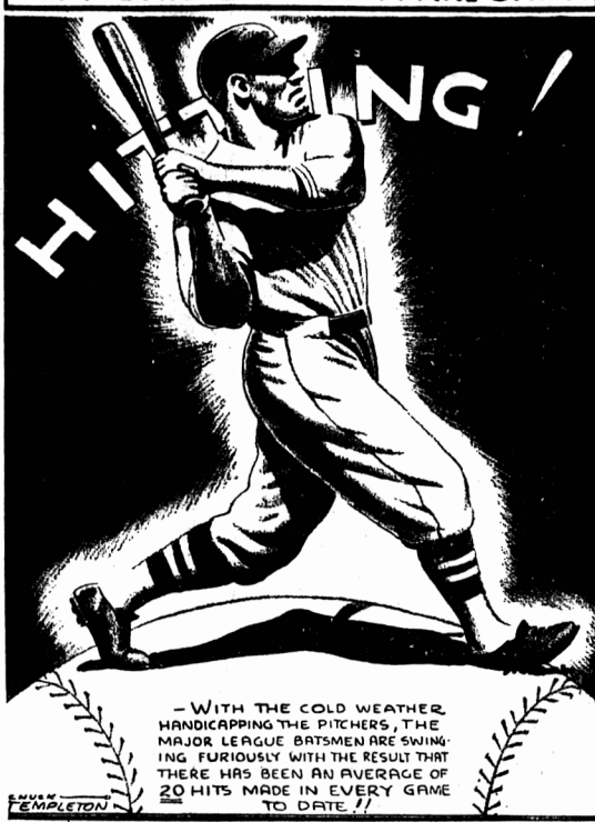
— WITH THE COLD WEATHER HANDICAPPING THE PITCHERS, THE MAJOR LEAGUE BATTERS ARE SWINGING FURIOUSLY WITH THE RESULT THAT THERE HAS BEEN AN AVERAGE OF 20 HITS MADE IN EVERY GAME TO DATE.