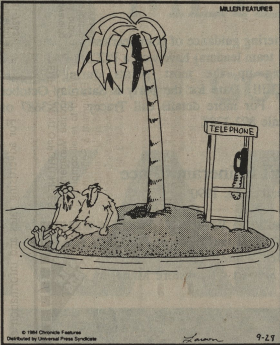
"For the hundredth time in as many days!... I haven't got a quarter!"