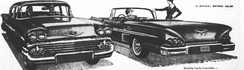
Glamorously new Bel Air 4-Door Sedan — a beautifully moving Bel Air! Come try it!

Your Chevrolet dealer is waiting right now to show you the beautiful way to be thrifty — the '58 Chevrolet.