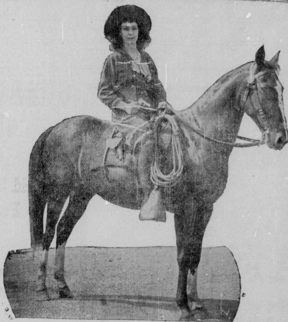
AN ATHLETIC LADY.