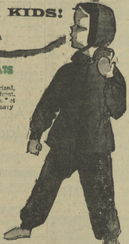
YOUTH CENTRE AT BOTH STORES