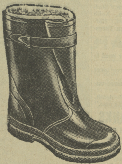
Men's LEATHER TOPS

Hi-cut with sturdy two piece tanned leather uppers. Full bellows tongue.