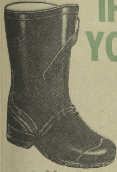
Men's Rubber Boots

IF YOUR FEET ARE WARM YOU FEEL WARM ALL OVER