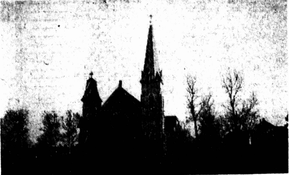
Present Church, begun in 1891, completed in 1893