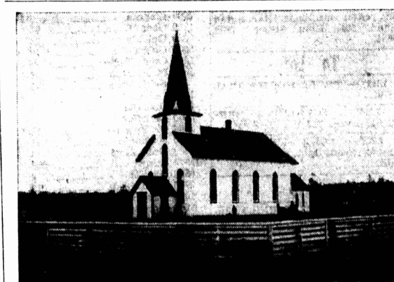
First Church, begun in 1867, opened 1870; destroyed by fire in 1890.