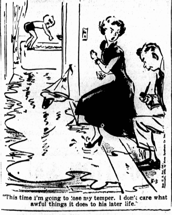
"This time I'm going to lose my temper. I don't care what awful things it does to his later life."