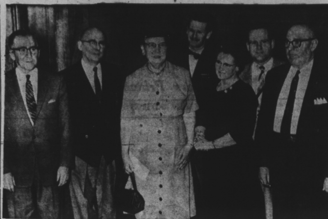
MEMBERS OF THE executive of the Prince Edward Island Cancer Society gathered for an informal chat following the annual meeting of the group held at the Charlottetown Hotel last evening.

ALL THIS AND MORE in tomorrow Evening's Patriot offers bonus values in good reading for the whole family. Three big sections every Saturday, including Weekend Magazine and 16 pages of color comics, make The Patriot the Island's best newspaper buy.