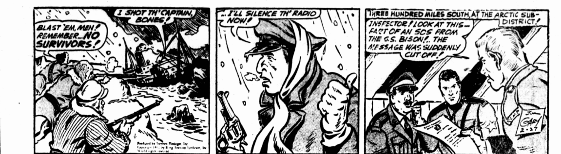
By Ham Fisher